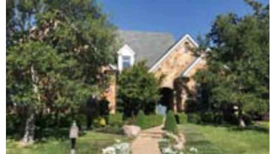
SOLD - 30 Sanford Lane, Lafayette 5BD | 4BA + 2 Partial | 4,906± SF | 0.54 AC Sale Price $4,000,000 | Represented the seller