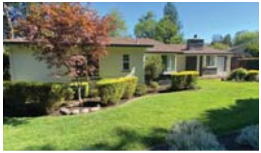
SOLD - 3629 Happy Valley Lane, Lafayette 3BD | 2BA | 1,645± SF | 0.25 AC Sale Price $1,640,500 | Represented the buyer

Contact us to hear how we will help you with your real estate needs and learn about our 0% loan for home improvements to prepare your home for sale.